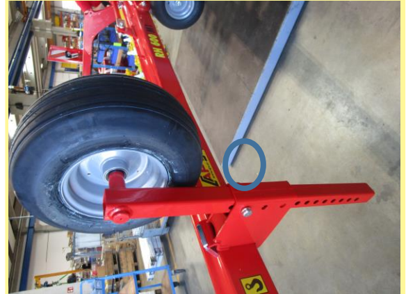
Figure 5: Removing the linch pin & pin.