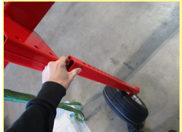
Figure 6: Pulling out the feeler wheel and rotating it.