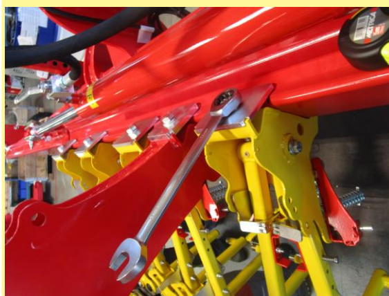
Figure 3: Bolting on the arm carrier pair.