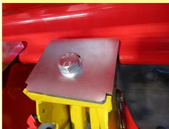
Figure 2: Placement of the arm carrier pair.