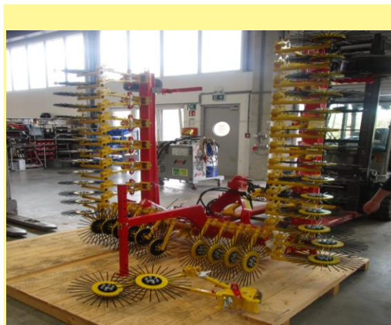
Figure 1: The Rotary Hoe on the transport pallet.

These instructions are for final assembly after container shipping, since trouble-free shipping can be ensured by removing or rotating certain components.