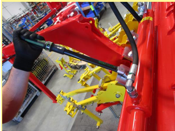
Figure 4: Tightening with torque.